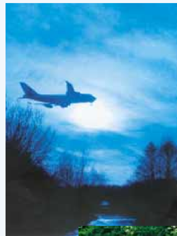
Coming into land over the River Bollin.