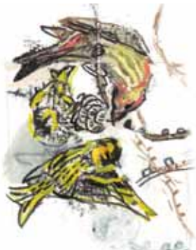
Among the Trees Crossbills and siskins are regular winter visitors to Delamere Forest

Climb over a pair of waymarked stiles at the top of the field, and bear right, gently uphill on a broad track beneath tall beeches. When it meets a wider forestry track at the crest of the slope, turn right, and follow the winding track downhill into a dip, some 300 metres later. A signpost here points to 'Urchin's Kitchen' 5 , a narrow sandstone gorge hidden amid the trees. This atmospheric, 30-foot deep glacial outwash channel was formed deep beneath the ice towards the close of the last Ice Age.